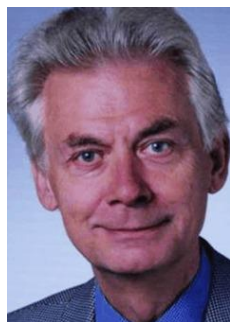
Prof. Herbert W Roesky Georg-August-Universität, Göttingen, Germany